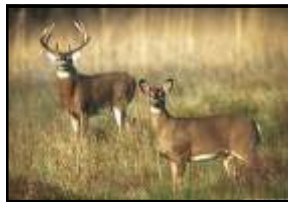
White Tailed Deer

We made our way to the river to get a drink before we started out again. While we were getting a drink we noticed two of those humans, but this time they weren't in those bizarre fast things and they didn't have those things that have killed many of our kind. We decided to run into the woods just to be safe.