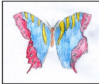
Illustration by Ms. Basketball Butterfly

I saw this butterfly outside my house. I was going to the store with my mom. It was in a blue rosebush in my garden. I was playing basketball and I watched it lay its eggs on a leaf on the rose bush. It was watching me play basketball.