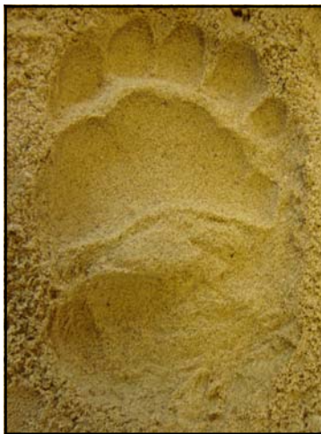
One of My Footprints