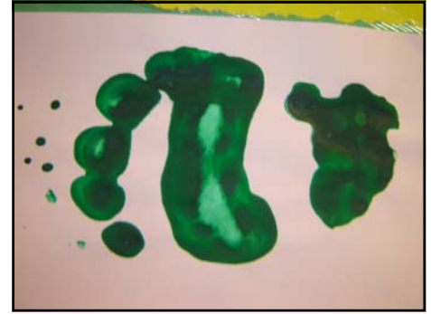
Print of Black Bear Track Courtesy of Mr. Natural Scientist

was swimming (kids don't try this at home!). Then it took me into its beaver den, we swam under the water to get in. We went inside and watched Beavers Days of Our Lives and the Beaver Odd Parents on their beaver vision. After watching beaver vision I left the den to find more tracks. I swam across the pond and found more tracks on the other side. I walked part way into the woods and found 5 black bears eating blueberries.